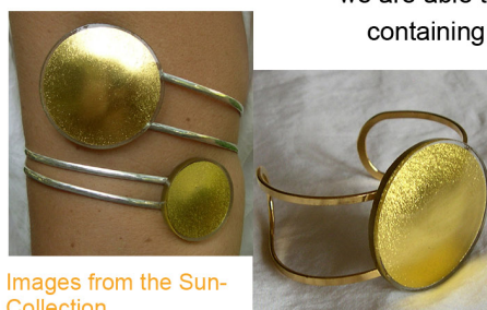
Images from the Sun-Collection

Thanks to this unique process, we are able to provide jewellery containing the purest gold for an excellent price.